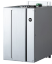
Intel Core i Class Book Mount Box PC