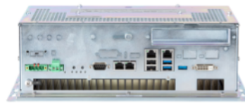
Intel Core i Class Wall Mount Box PC