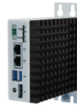
Intel Atom Class Book Mount Box PC and Thin Client